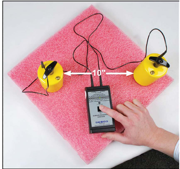
Figure 4. Using the 19641 test leads and 50003 five-pound electrodes to measure R tt

Clean the material's surface for test lab measurements, but do not clean the surface for materials that are already installed. Only clean and re-test the installed material if failure occurs.