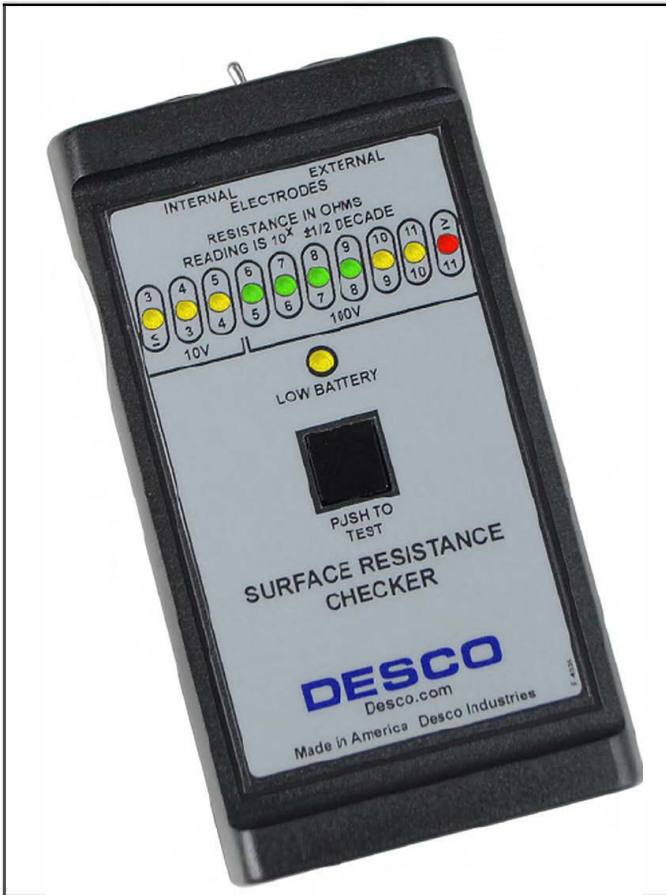
Figure 1. Desco 19640 Surface Resistance Checker