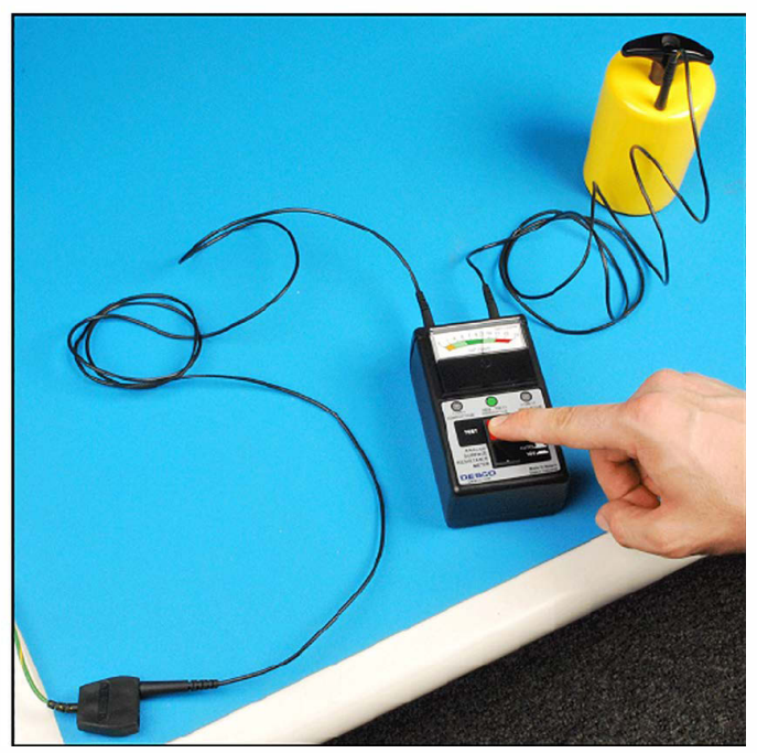
Figure 3. Using the test leads and one 5 pound electrode to measure RTG

CAUTION: If there is a current limiting resistor in the worksurface and the worksurface resistance is lower, the measurement will primarily be the resistance of the resistor. It is recommended to measure RTT particularly if the material color is black.