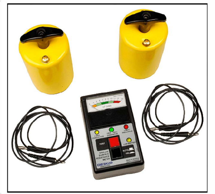
Figure 1. Desco <u>19784</u> Analog Surface Resistance Test Kit