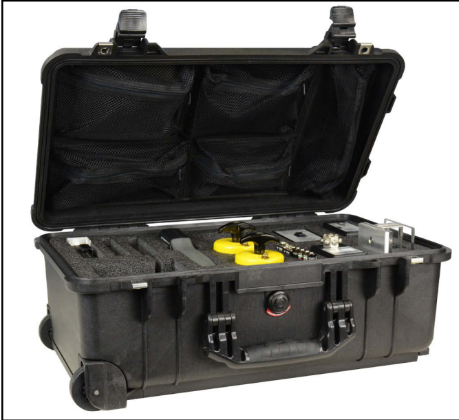
Figure 1. Desco 19790 ESD Survey Kit