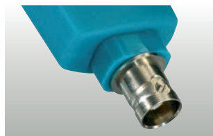
testo 206-pH3: pH3 probe head with BNC interface