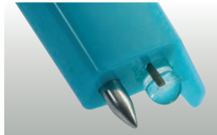
testo 206-pH1: pH1 probe head for liquids