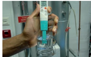
Ideally suitable for monitoring heating system water according to VDI 2035.