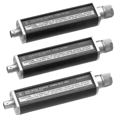
HP 346A, 346B, 346C