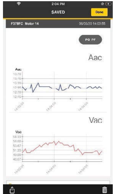
Data gathered by Fluke Connect can pinpoint elusive intermittent faults. Data collected over regular intervals can be used to spot small changes before they grow into major problems.