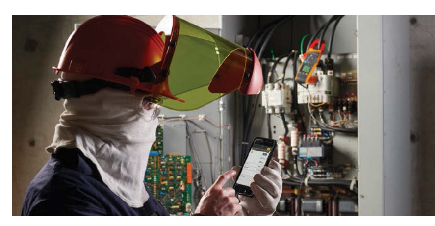
Fluke Connect allows measurements to be sent to a smartphone for logging, collaboration and analysis.

With Fluke Connect software you can remotely log, trend and monitor measurements to pinpoint intermittent faults. Fluke Connect also allows you to gather data as the basis for a preventive maintenance program.