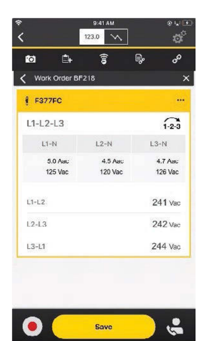
Fluke Connect pulls all data related to three-phase measurements including phase rotation and presents the full set of data for analysis at a glance.