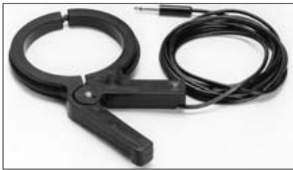
The ring clamp is optionally available.