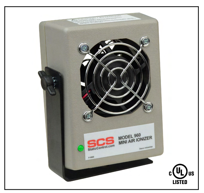
Figure 1. SCS 960 Mini Air Ionizer