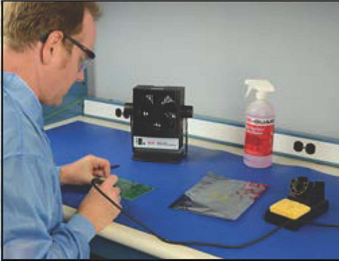
Figure 2. Using the 963E Benchtop Air Ionizer