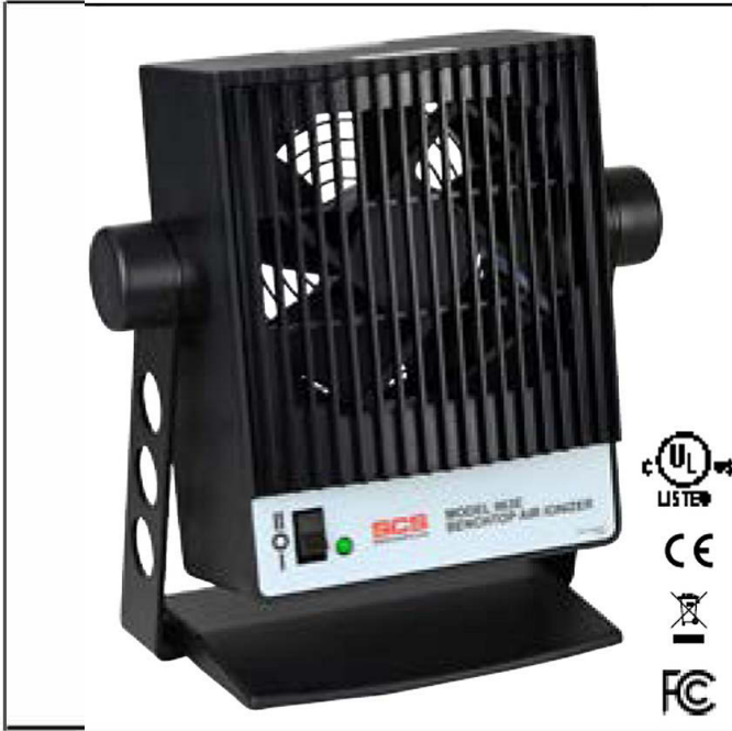
Figure 1. SCS 963E Benchtop Air Ionizer