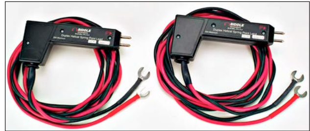
Cat. No. 242011-7