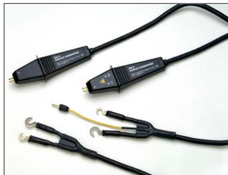
Cat. No. 1006-444 (DH4-C)