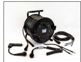
Cat. No. 1000-809

(Available through Megger U.S. Authorized Stocking Distributors.)