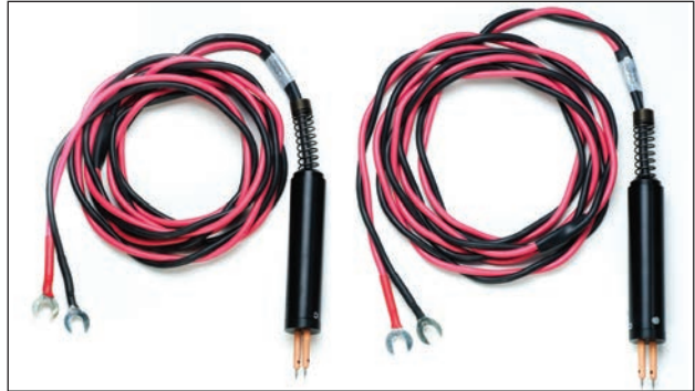
Cat. No. 242003-7