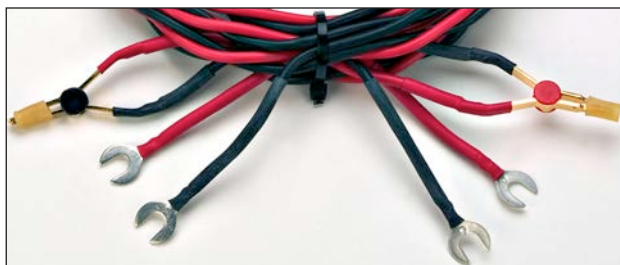
Cat. No. 241005-7