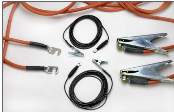
Cat. No. 1008-028