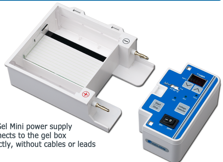
myGel Mini power supply connects to the gel box directly, without cables or leads