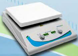
H3710 10 x 10 Inch Series