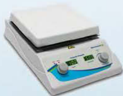
H3770 7 x 7 Inch Series