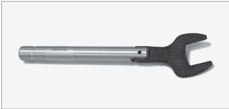
Keysight 20 mm torque wrench 8710-1764

The APC-3.5 (m) connector used on the SNS Series of noise sources has an extra-large nut to make it easier to tighten without applying torque to the noise source body. A 20 mm torque wrench is also available from Keysight for this application. Please contact your local Keysight representative for ordering information.