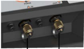
3/8" Inlet Port 1/4" Outlet Port