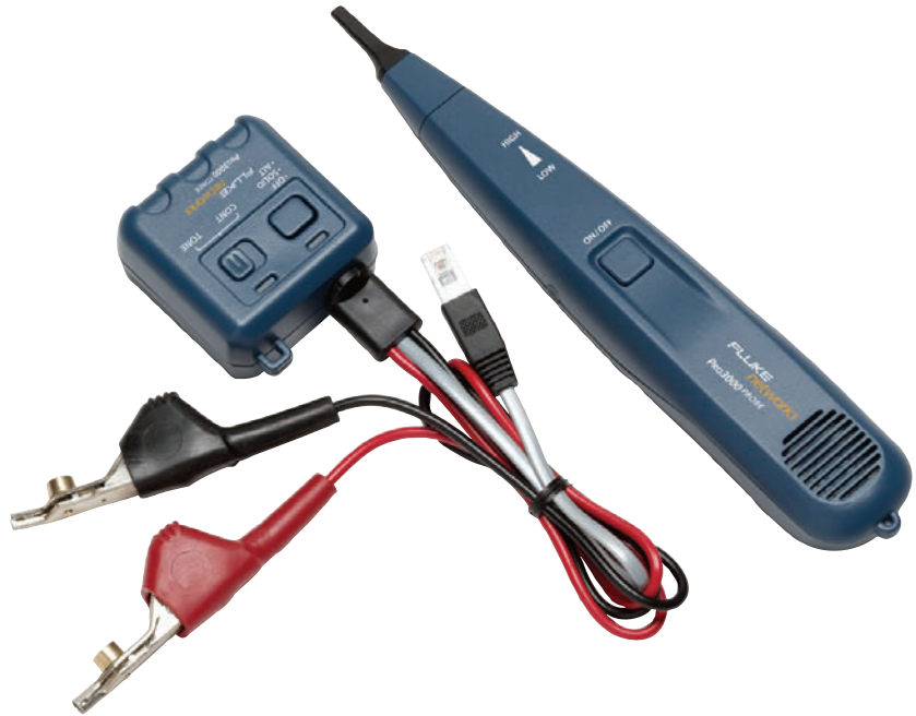
Pro3000 Toner and Probe

The Pro3000 Analog Tone and Probe are your best choice for toning and tracing wire on non-active networks, and specifically for identifying individual pairs with SmartTone™ technology. Angled bed-of-nails clips allow easy access to individual wires, and the RJ11 connector is ideal for use on telephone jacks. The large loud speaker on the probe allows you to hear through drywall, wood or other enclosures to find wires quickly and easily. You can send this loud tone up to 10 miles on most cables! Attach the nylon pouch to your belt, and you will be equipped for any wire identification job.