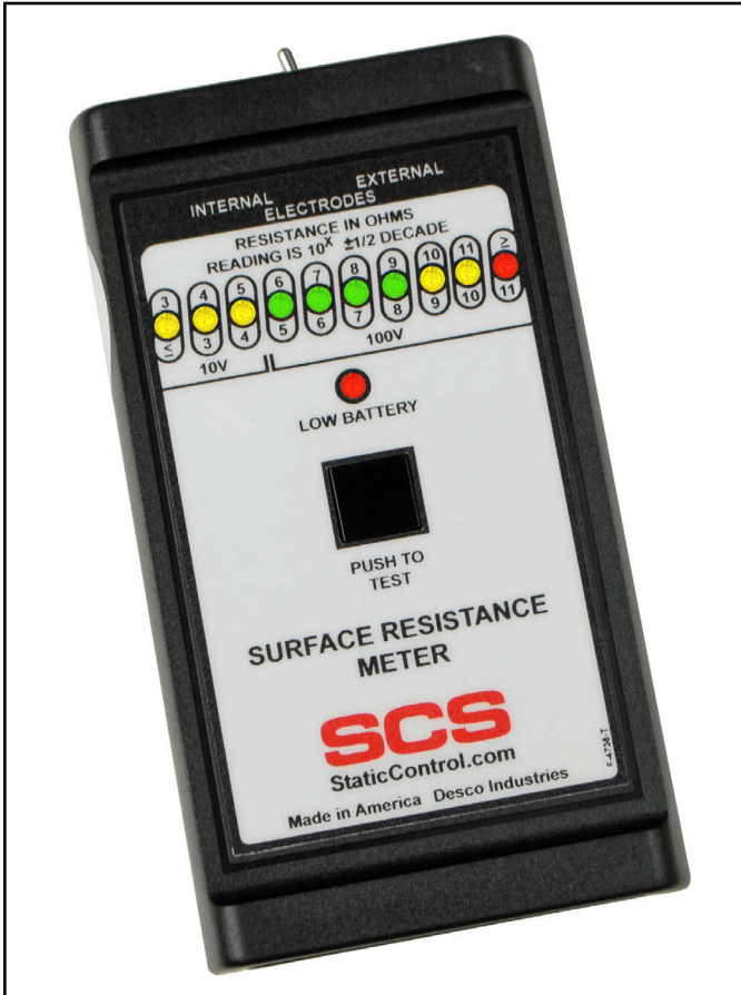
Figure 1. SCS SRMETER2 Surface Resistance Meter